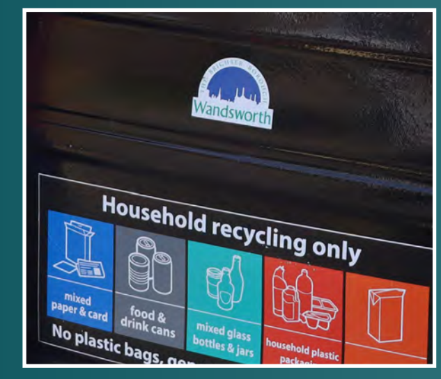
New recycling bins are being installed on the Alton estate

In 2023, we knocked on doors of all council managed properties to get your views on rubbish and recycling services, as well as handing out information to help you recycle the right things. This work will help shape the service you receive, so that we focus on your top priorities and concerns when it comes to rubbish, recycling and fly-tipping.