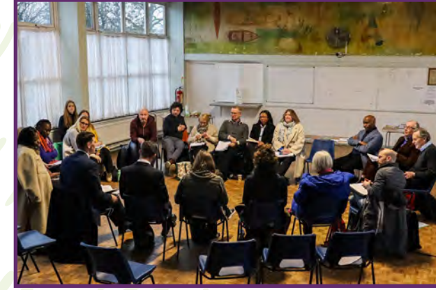
Evidence gathering session at Alton Community Centre

Over the course of the year, the Commission considered how five themes contributed to cost-of-living pressures: Housing, Food, Energy, Transport, and cross-cutting systemwide issues. They heard from local residents, businesses and community organisations about their experiences; holding six-evidence gathering sessions across the borough, including one in Roehampton in the Alton Community Centre in February 2023, and conducting a borough-wide survey open to all residents.