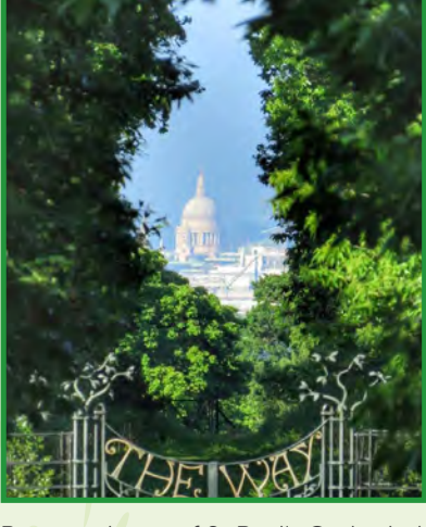
King Henry's Mound Telescope