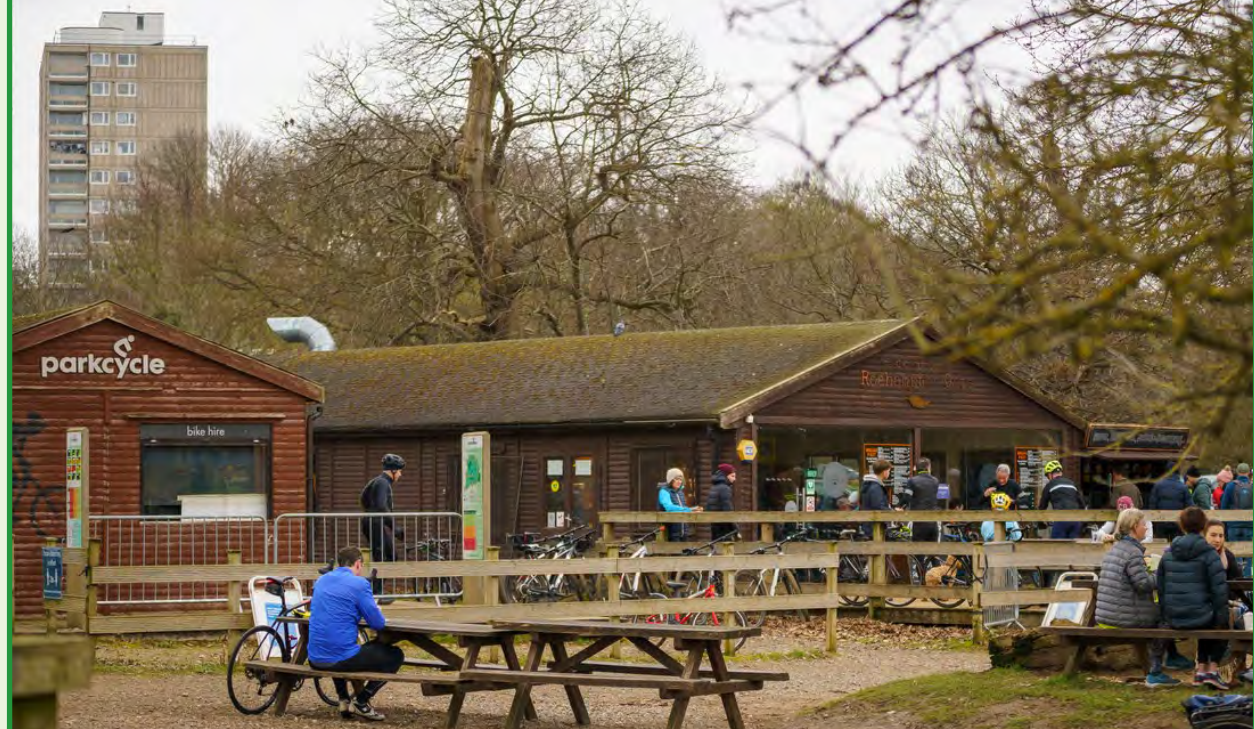
Roehampton Gate Café